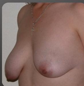
Before Breform Implant

We do request that doctors wishing to utilise the Breform contact us in advance for information on the methodology of the procedure.